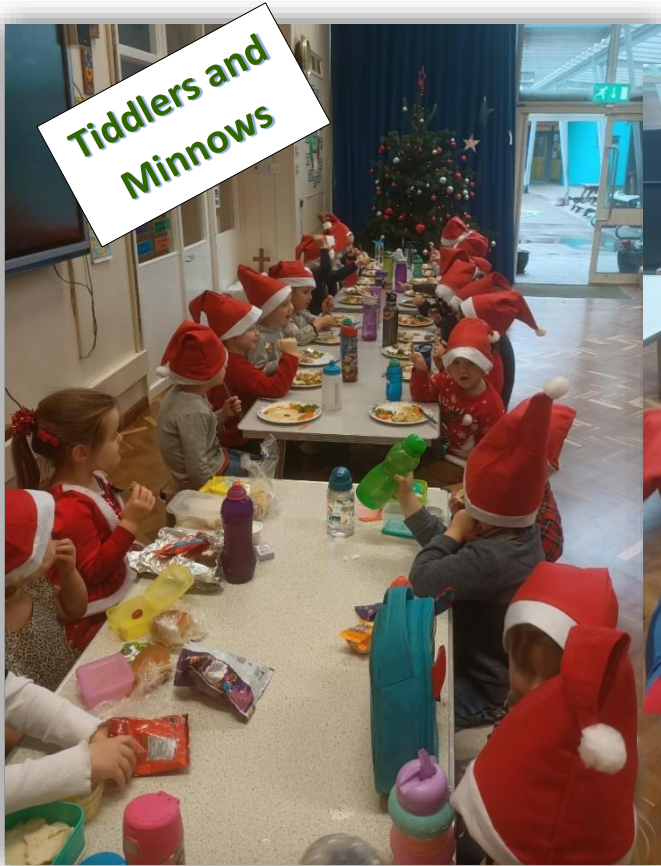
Tiddlers and Minnows